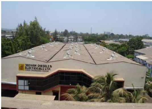
Arial view of Jeevan Diesels & Electricals Ltd. Unit III, W/Silvassa