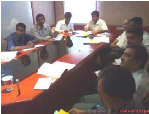
An interactive session during the Program.

(At BANGALORE starting 26 th June 2007 Onwards)