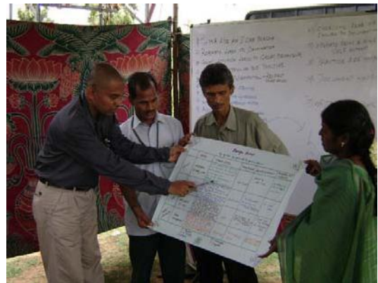
Participants during the creative group presentation.