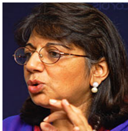
Dr. Kiran Mazumdar Shaw, Chairman & Managing Director, Biocon Limited.

She was born on March 23, 1953 in Bangalore. She had her schooling at Bishop Cotton Girls School and Mount Carmel College at Bangalore. After doing completing her B.Sc. in Zoology from Bangalore University in 1973, she went to Ballarat University in Melbourne, Australia and qualified as a master brewer. Ms. Shaw also received an honorary Doctorate of Science, from her alma mater, Ballarat University, in recognition of her pre-eminent contributions to the field of Biotechnology. Recently she also received an Honorary Doctorate from the Manipal Academy of Higher Education (MAHE), in recognition of her outstanding achievements in biotechnology and industrial enzymes.