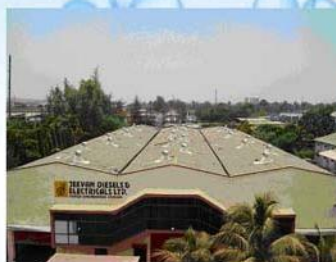
Arial view of Jeevan Diesels & Electricals Ltd. Unit III, W/Silvassa