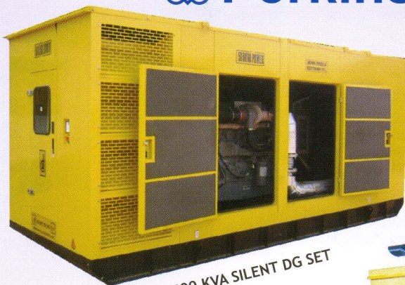
500 KVA SILENT DG SET