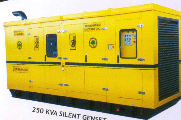
250 KVA SILENT GENSET